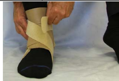
Wrap Arch Suspender strap around leg