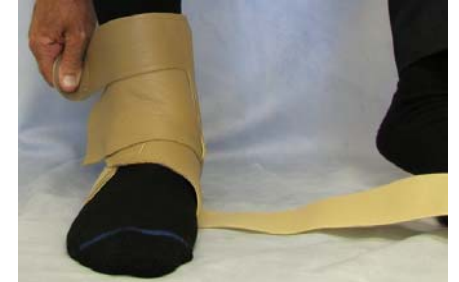
Secure the top strap