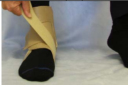
Lift the Arch Suspender strap