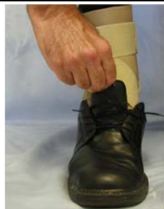
Step into shoe with open laces