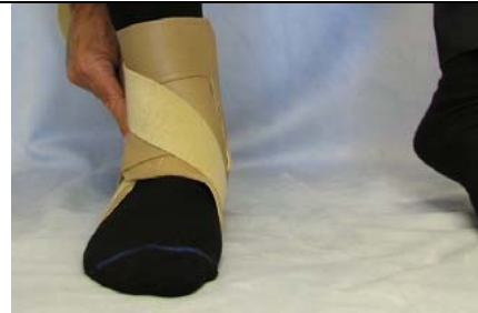
Pull Arch Suspender strap across ankle