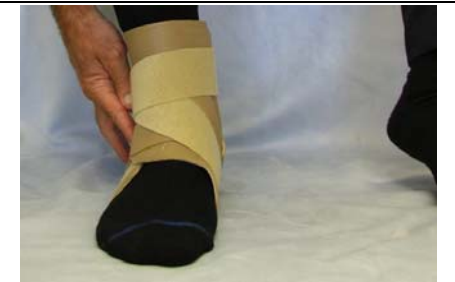
Secure Arch Suspender strap across front of leg