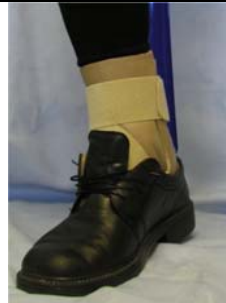
Use shoe horn if needed to slip into shoe