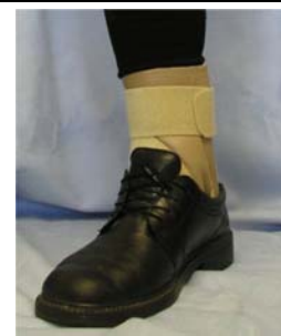
Secure shoe laces