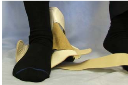
Place foot on brace with straps open

When fitting the California AFO, sit in a chair with knee bent and foot flat on floor. A crew length sock must be worn.